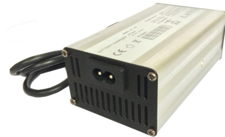
Figure 1. Appearance

Input AC wire is 150cm long with European plug( IEC 60884-1) Output DC wire is 95cm long with RCA plug