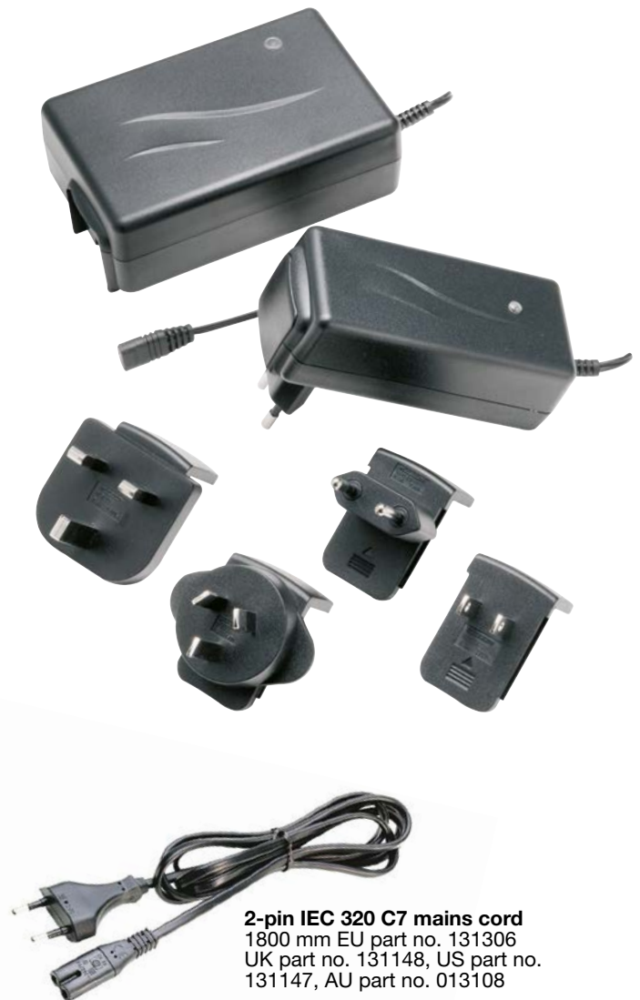
2-pin IEC 320 C7 mains cord 1800 mm EU part no. 131306 UK part no. 131148, US part no. 131147, AU part no. 013108